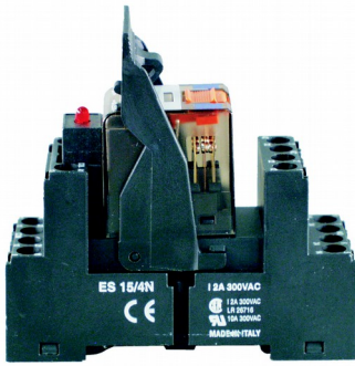
depth 73 mm