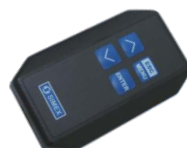
IR remote controller SIR-15